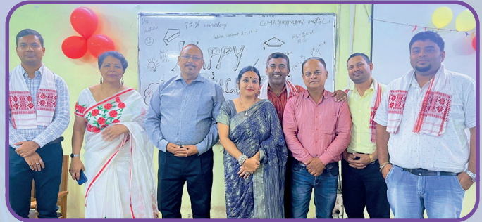
Teacher's Day Celebration on 5th Sept 2024