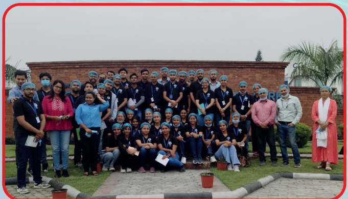
Chaygaon Industrial Park ( Wai Wai CG Food Park, Pepsi Co India, Creative Propack Ltd.) on 22nd March 2025