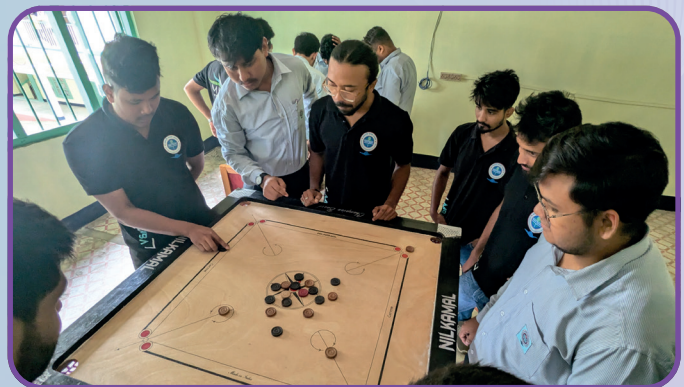
College Week on February 2024