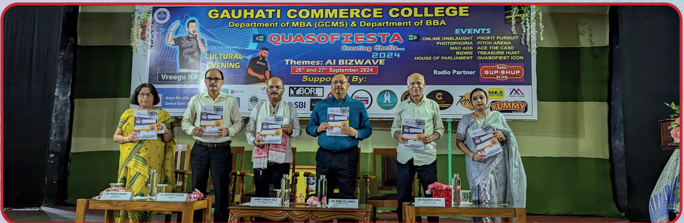
Inauguration of newsletter Anuranan 5th volume