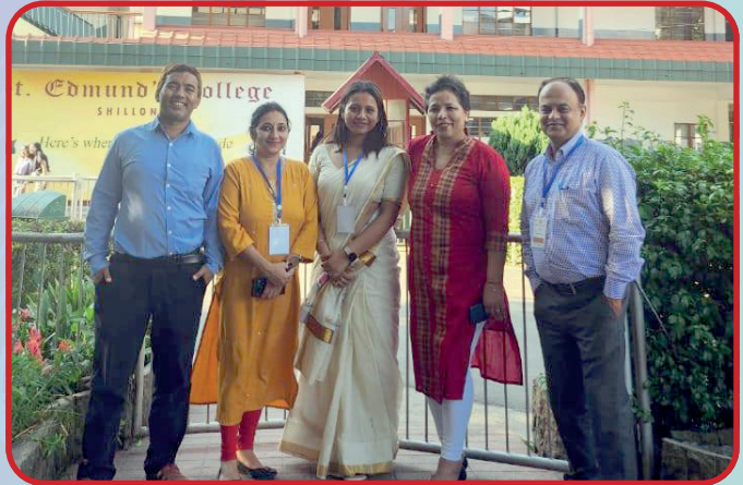
International conference in Edmunds College, Meghalaya