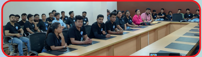
Trinity Fructa Private Limited, Managldoi, Assam, on 28th March 2025