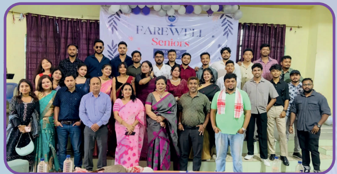
Farewell of the Final MBA Batch 2022-2024